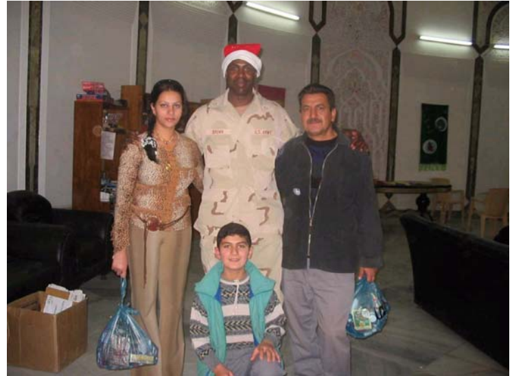
A family of Iraqis receiving Christmas gifts provided by the Blue Star Mothers.

(4) Homeless veterans- Providence Home, Salvation Army, Veterans Formation.