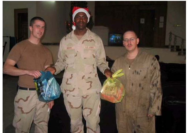
Santa Claus delivering Blue Star Mother packages to more of our troops.

The Patriot Girls are promoting US Savings Bonds to support our troops fighting the war on terrorism. For more information, visit their website at www.usfreedombonds.com .