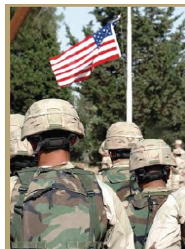
The Post-9/11 Veterans Educational Assistance Act of 2008

If you transferred to the Post-9/11 GI Bill from the Montgomery GI Bill – Active Duty, Montgomery GI Bill – Selected Reserves, or the Reserve Education Assistance Program, you may also receive Post-9/11 GI Bill benefits for flight training, apprenticeship or on-the-job training programs, and correspondence courses.