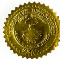
MARK SANFORD GOVERNOR STATE OF SOUTH CAROLINA

throughout the state and encourage all South Carolinians to recognize military working dog teams for their valuable contributions to saving lives during armed conflict and peacetime in the defense of our country.