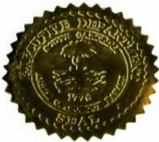
MARK SANFORD GOVERNOR STATE OF SOUTH CAROLINA

throughout the state and encourage all South Carolinians to honor the mothers whose sons and daughters made the ultimate sacrifice in defense of our country and the freedoms we cherish.