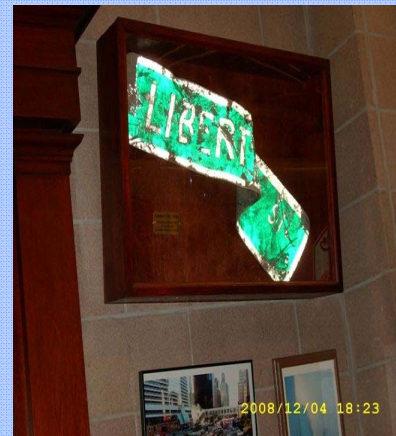
Pictured left to right: (1) Crane is sitting where the twin towers were. (2) This is a memorial that Station #55 put up for all of those who gave their lives. (3) This sign was found in front of Fire Station #55. These pictures were from a trip I made to New York City in December 2008